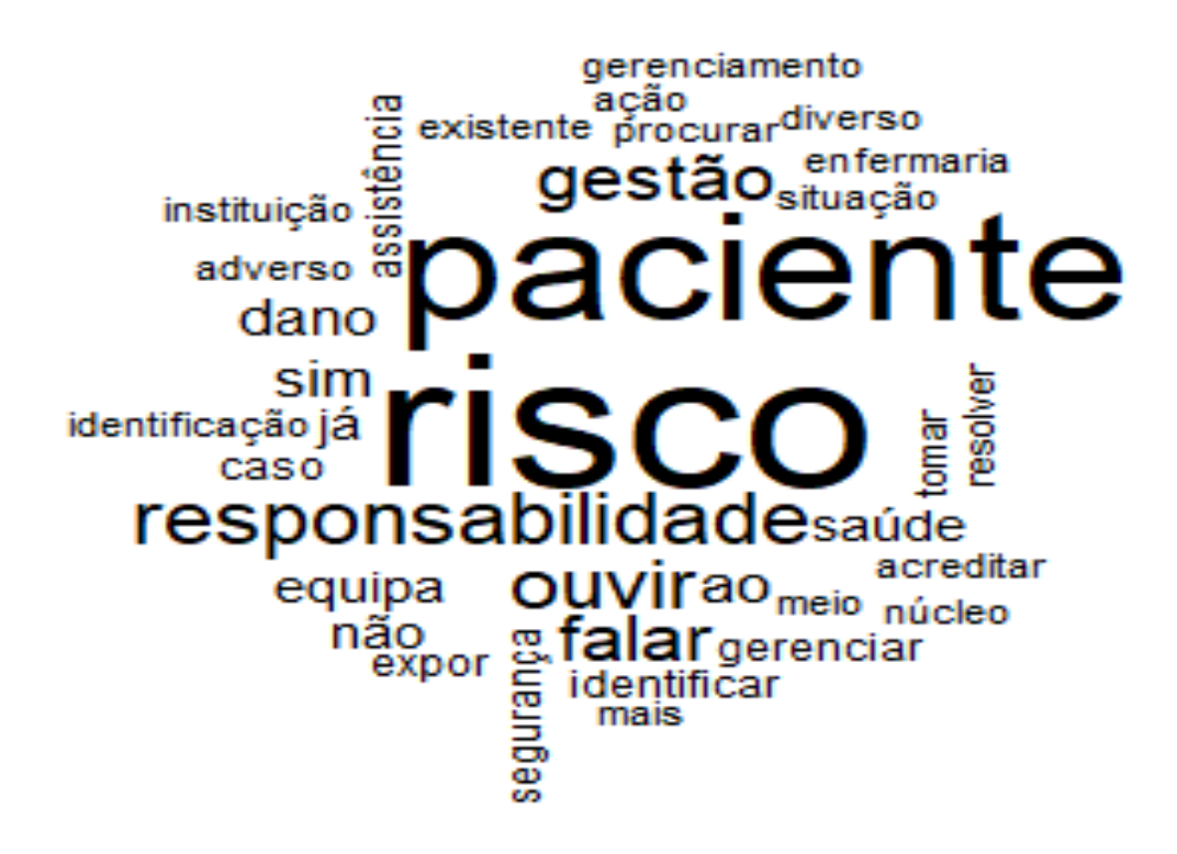
Figure 02: Word cloud

Note: The words of the dendogram and word clouds were kept in the original language to meet the specifics of the software and the adopted method.